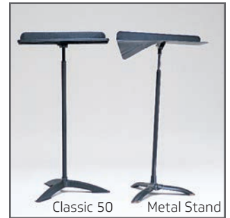
Classic 50 Metal Stand

We wanted to see how the Classic 50 and a metal stand would compare when subjected to identical sustained pressure.