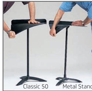
Classic 50 Metal Stand

We tested Classic 50 against metal to see which would bend — and stay bent.